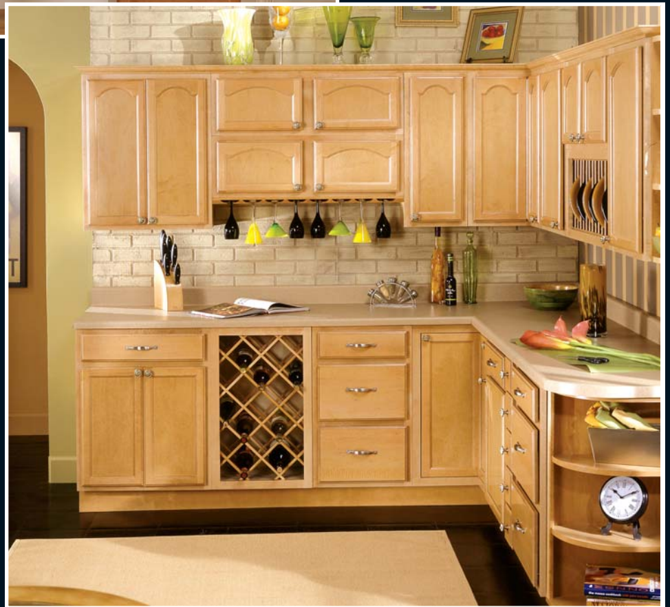
Mapleton Featured in Wheat Finish.